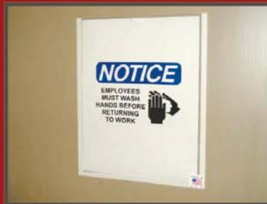
Place it in restrooms/breakrooms to communicate to your employees