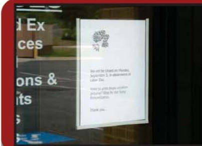
Place it near entrances/exits to communicate to your customers

Show that you have a professional business and that you take pride in your facility's appearance. Use the handy HANG UP notice holder to display information for staff and patrons in a neat and orderly manner by dropping in a standard 8-1/2" x 11" sheet of paper. It's simple and easy to change out your notices!