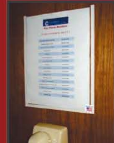
Place it in general areas to communicate to your visitors