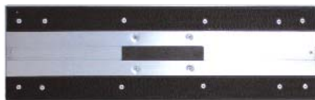
160 Series Bottom detail