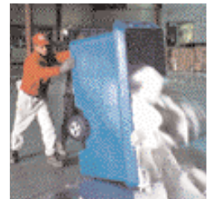
Smooth interior Design for easy Dumping & Cleaning

Roto-Molded from FDA Approved Polyethylene. Nestability - Freight & Space Savings. Steel Under-Carriage for Strength & Durability. Recessed Poly-Core Wheels Protect Walls. Double Wall Box Style Lip Provides Maximum Impact Resistance. Molded-in Handles Increase Maneuverability. Special Colors Available - Ask for Details.