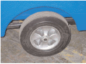
Recessed Wheels Protect Walls

It's a Tilt Truck. It's a Box Truck. It's a Box that Tilts!