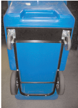
Steel Under-Carriage for Strength & Durability