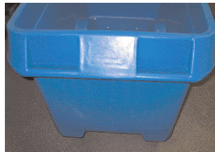
Ergonomically Designed Handles for Comfort & Easy Dumping