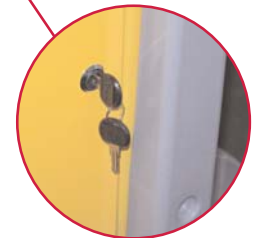
Metal Lock with 2 keys