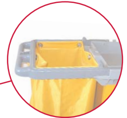
#6153 Deluxe Handle ◆ Steer ◆ Maneuver ◆ Ergonomic