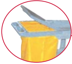
#6153 Hinged Lid Cover blocks odor & unsightly trash.