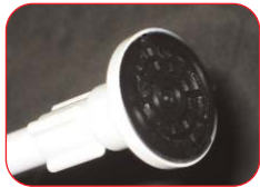
Both ends have a non-slip rubber tip to firmly grip the contact points, while at the same time protecting the contact surface.