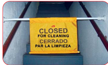
Blocks doorway or halls from 30" to 53" wide for cleaning