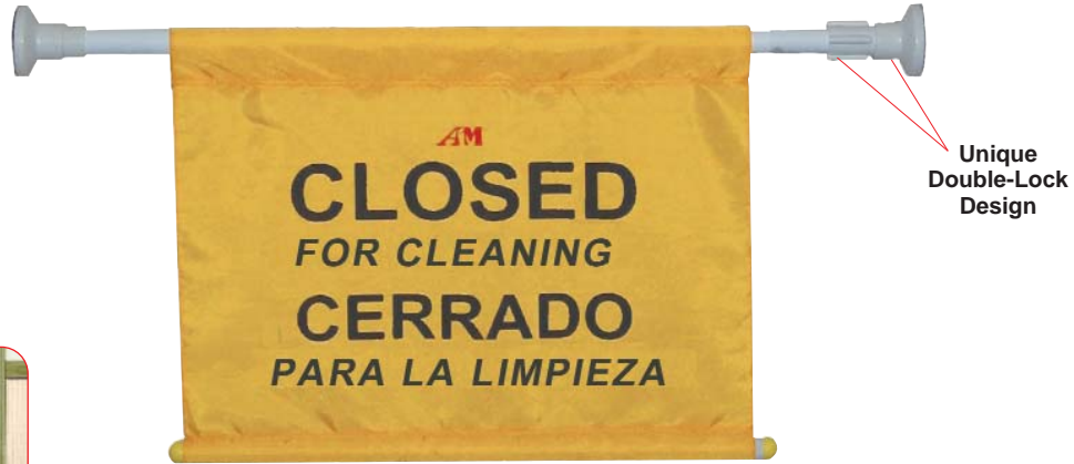
Unique Double-Lock Design