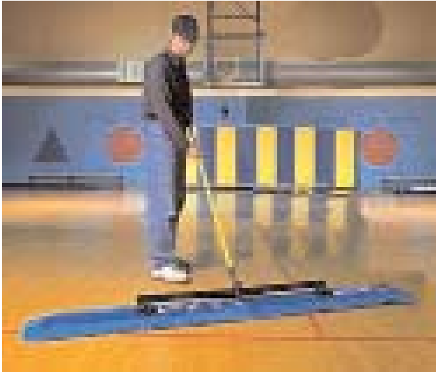
Item # 154-6